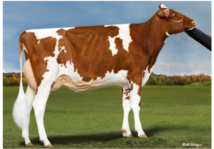
Golden-Oaks A Talent-Red EX-90

VG-86 Altitude-Red x EX-90 Avalanche*RC x EX-94 Defiant RDC x EX-92 Debonair Red x EX-91 Advent-Red x EX-93 Emerson x VG-87 Rudolph x EX-96 Stardust x EX-95 Inspiration x VG-85 Sheik