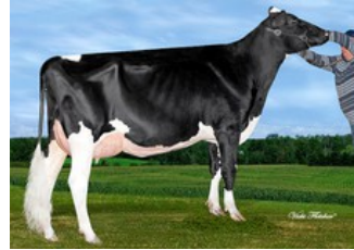
Misty Springs MOM Brenna RDC VG-86