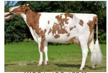
MAR Belami P Red GP-83