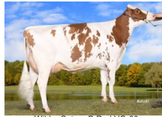
Wilder Saturn P Red VG-88