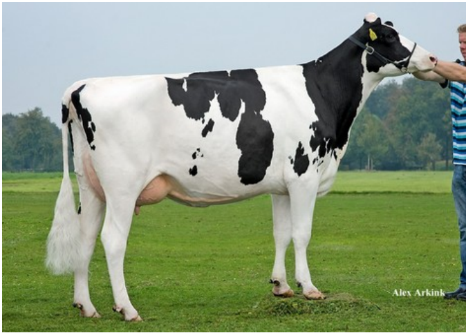
Sanderij Massia Sneeuwvitje RDC VG-89