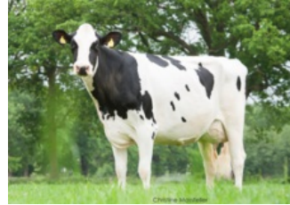
Sanderij Massia Sneeuwvitje RDC VG-89