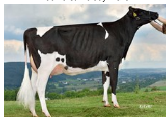
Vekis Sudan Mellow VG-88