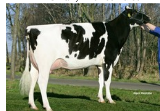
Vekis Xaco Melody VG-87

VG-85 Vh Crown x VG-87 Gymnast x Shep x VG-86 Balisto x VG-88 Sudan x VG-87 Xacobeo x VG-85 Goldwyn x VG-85 O Man x VG-87 Durham x GP-83 Fred