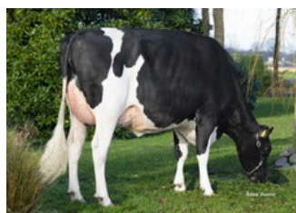
Veelhorst Melody VG-87