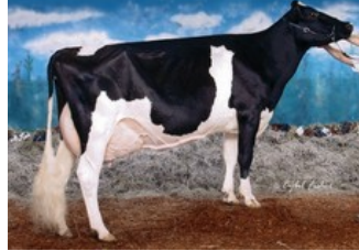
Lylehaven Form Laura EX-94