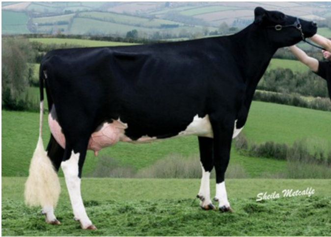
Acecroft Goldwyn Lila Z VG-87