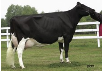
Thiersant Lili Starbuck EX-94

Mitchell x VG-86 Gymnast x EX-90 Nirvana x VG-85 Numero Uno x VG-86 KERNDTWAY HOWIE x VG-87 Goldwyn x EX-94 Durham x EX-94 Formation x EX-94 Starbuck x VG-86 Astro Jet