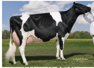
Lylehaven Lila Z EX-94