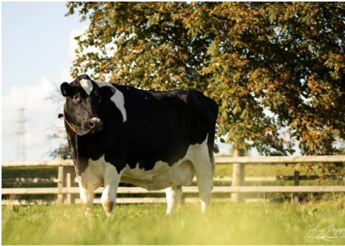
Poppe Fienchen 580 RDC VG-89