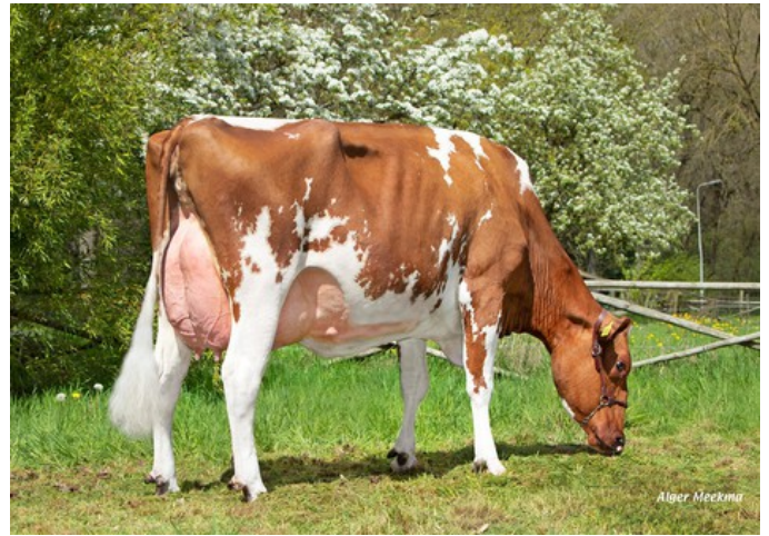
Poppe Fienchen 1569 Red VG-85

GP-84 Swingman Red x VG-85 Born P RDC x GP-84 Silver x VG-86 Danillo x VG-89 Stol Joc x VG-85 Lightning RDC x GP-84 Konvoy x VG-85 BW Marshall x EX-92 Factor RF x VG-88 Leadman