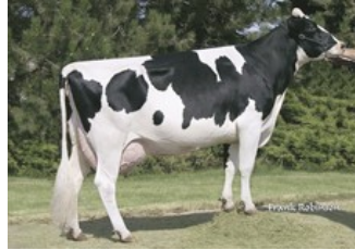
Seagull-Bay Oman Mirror VG-86