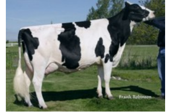
Seagull-Bay Manat Mirage EX-90

VG-86 Big Bubba x VG-87 Bookem x VG-86 Shottle x VG-86 O Man x EX-90 Manat x EX-91 Celsius x VG-85 Melwood x VG-85 Secret x EX-91 Tony x VG-87 Haven