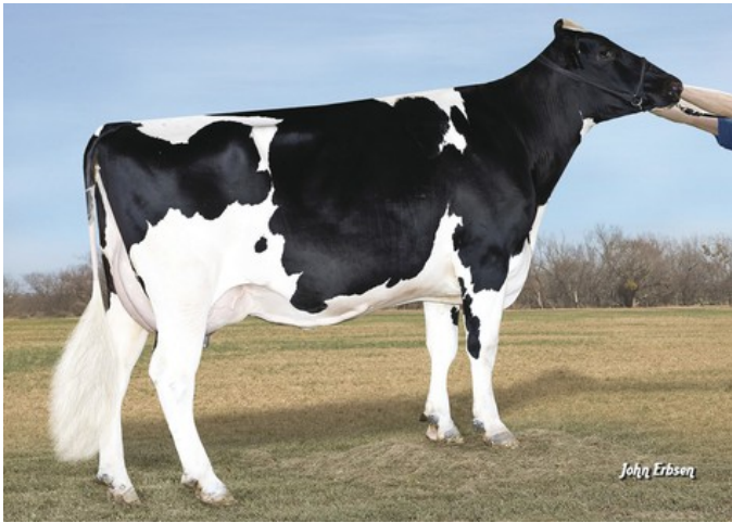
Roylane Shot Mindy 2079 VG-86