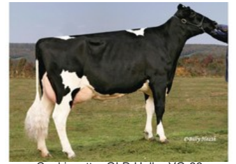
Cookiecutter GLD Holler VG-88