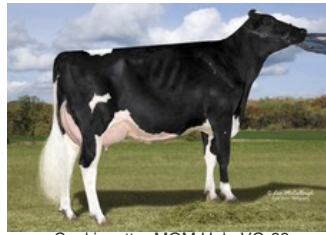
Cookiecutter MOM Halo VG-88