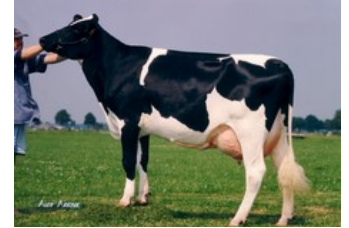
Broeks Rozelle VG-89

GP-83 Frazzled x VG-85 Silver x GP-84 Tango x Altalota x VG-86 Jeeves x VG-87 Shottle x VG-87 Jester x VG-89 Ronald x EX-91 Southwind x EX-92 Starwar