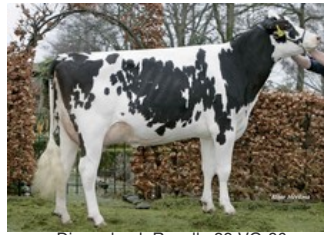
Diepenhoek Rozelle 38 VG-86