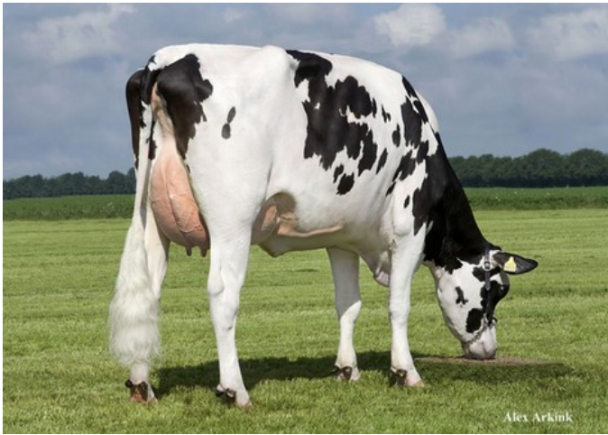
Diepenhoek Rozelle 54