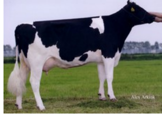
Diepenhoek Rozelle 4 VG-87