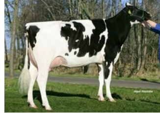
Vekis Xaco Melody VG-87