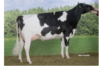
Caps Mairy 4 VG-85

VG-87 Gymnast x Shep x VG-86 Balisto x VG-88 Sudan x VG-87 Xacobeo x VG-85 Goldwyn x VG-85 O Man x VG-87 Durham x GP-83 Fred x VG-86 Mascot