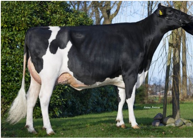
Veelhorst Melody VG-87