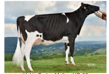
Vekis Sudan Mellow VG-88