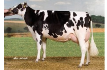
WEH Jessica VG-88

GP-82 Jorben x VG-86 Silver x VG-86 Supersire x VG-85 Bronco x VG-86 Jefferson x VG-88 Laudan x VG-87 Convincer x EX-90 Airliner x GP-84 Mountain x VG-86 Melwood