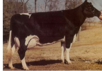
Rilara Mars Las Ravena EX-91