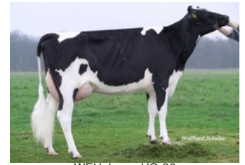
WEH Janne VG-86