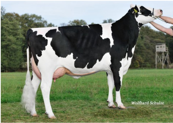
WEH Bronco Janet VG-85