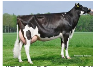
WEH Bronco Jill, Bronco x Janne VG-86