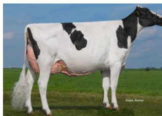
Holec Mogul Panzul VG-88