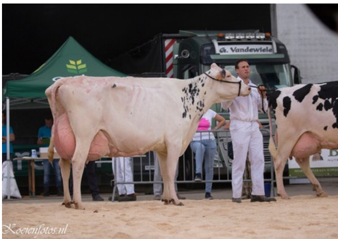
MarieClaire VH Zomerbloemhof EX-90