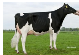
GS Paris VG-87