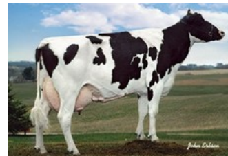
Rabur Outside Pandora EX-91

EX-90 Kingboy x VG-88 Mogul x VG-87 Man-O-Man x VG-87 Goldwyn x EX-91 Outside x EX-91 Rudolph x EX-92 Inspiration x EX-91 Triple Threat x EX-92 Tony