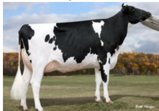
Rabur Gold Panzer VG-87