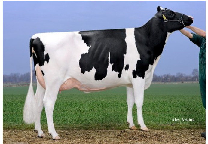
Drouner AJDH Aiko RDC VG-87

VG-86 Battlecry x EX-90 Kanu P x VG-87 Freddie x EX-91 Goldwyn x EX-95 Durham x EX-93 Prelude x EX-94 Jubilant RF x EX-96 Marquis King x EX-90 Brutus x EX-90 Lucifer Lad