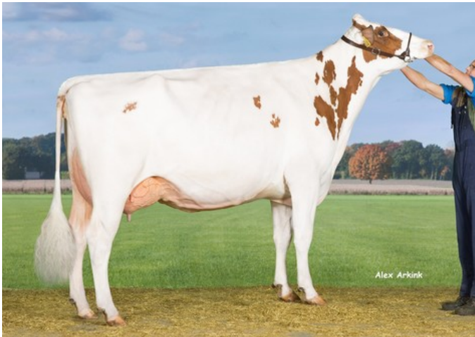
Drouner AJDH Aiko 1267 P-Red EX-90