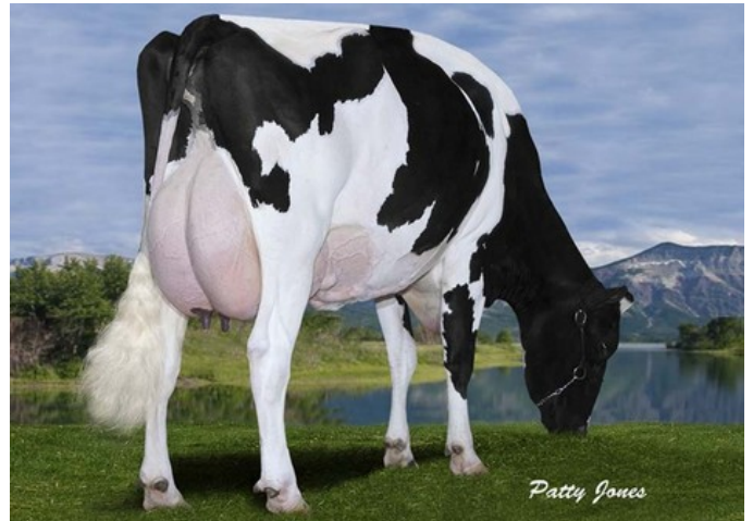
Gen-I-Beq Goldwyn Secret RC VG-87

VG-85 Silver x GP-83 Earnhardt P x GP-82 Colt P x VG-85 Socrates x VG-87 Goldwyn x VG-87 Durham x VG-86 Formation x VG-88 Aerostar x EX Enhancer x EX Christopher