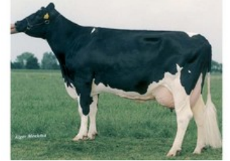
Delta Jabikje VG-85

VG-87 Sudan x VG-88 Bolton x VG-87 O Man x VG-88 Dustin x VG-85 Webster x VG-85 Branco x VG-87 Jabot x VG-86 Mascot x GP-81 Blackstar x VG-87 Chief Mark