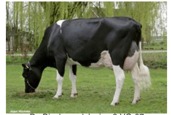
De Biesheuvel Javina 3 VG-87