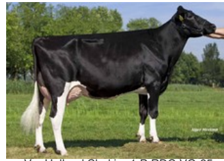
VanHolland Shakira 1 P RDC VG-85