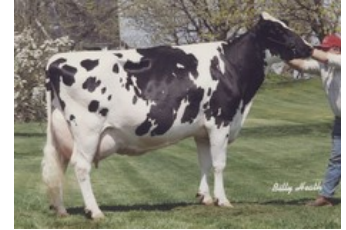
Windy-Knoll-View Ultimate Pala EX-94

VG-89 Supershot x VG-86 Snowman x VG-88 Planet x EX-93 Outside x EX-95 Rudolph x EX-94 Ultimate x VG-88 Lester