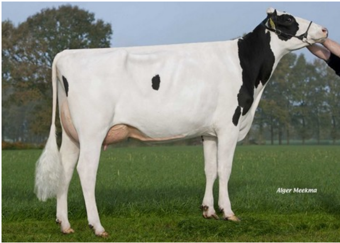
FG Feline VG-86