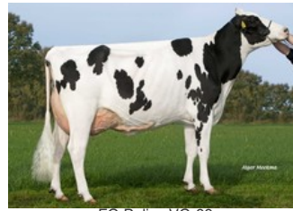
FG Policy VG-88