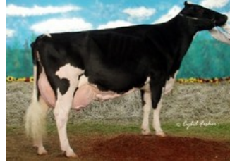
Windy-Knoll-View Promis EX-95