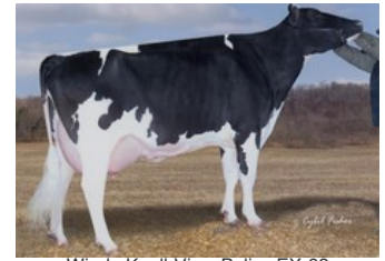
Windy-Knoll-View Policy EX-93