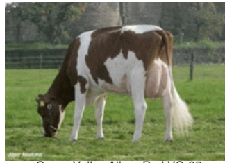
Green-Valley Allure-Red VG-87