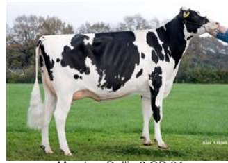
Manders Dellia 8 GP-84