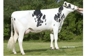
Tir-An O Man Neblina VG-87

Sargeant x VG-89 Bookem x EX-91 Gabor x VG-88 Sharky x VG-87 O Man x VG-87 BW Marshall x VG-85 Lord Lily x VG-86 United Nick x VG-89 Ned Boy x VG-86 Bell