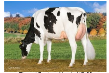
Tirs vad Bookem Nessie VG-89