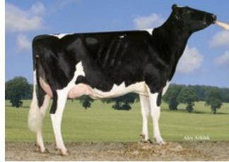
Tirs vad Gabor Netto EX-91