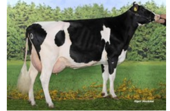
Caps Mairy 1 VG-85

Precision x Gladius x VG-87 Gymnast x Shep x VG-86 Balisto x VG-88 Sudan x VG-87 Xacobeo x VG-85 Goldwyn x VG-85 O Man x VG-87 Durham