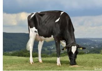
Vekis Sudan Mellow VG-88