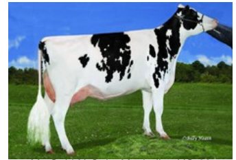
Ms Gold-N-Oaks Maybaline VG-88