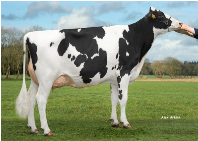
Tirsvad K&L Riveting Magnolia GP-84