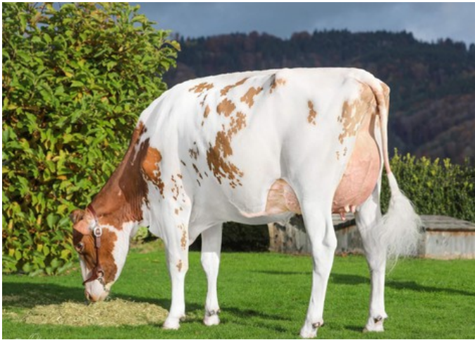
Swingmn Range 3 Red, fullsister Range16 Red VG-89