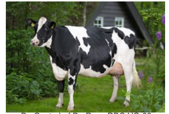
De Oosterhof Dg Rose RDC VG-89