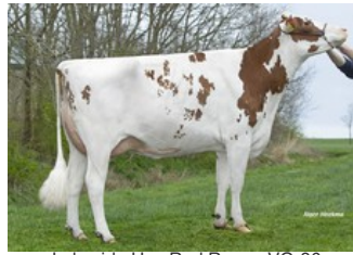
Lakeside Ups Red Range VG-86