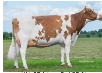
K&L GT Aderyn Red GP-84