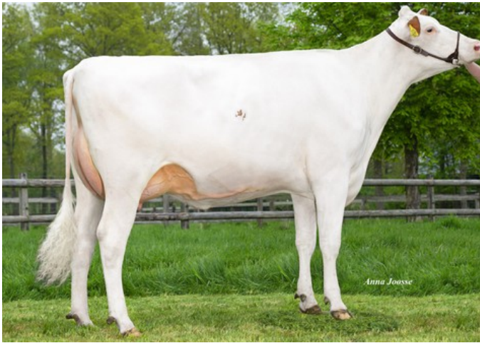
Poppe K&L Adele Red VG-85