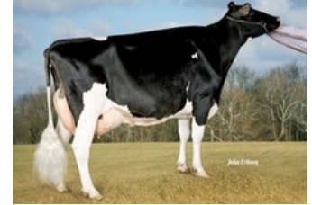
Kamps-Hollow Durham Altitude EX-95

Mask Red x GP-82 Star P RDC x VG-85 Gywer RDC x GP-84 Great Red x VG-87 Nugget RDC x VG-85 Supersire x EX-90 Superstition x EX-91 Goldwyn x EX-95 Durham x EX-93 Prelude