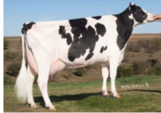
Jenniton Bolton Rowena EX-90