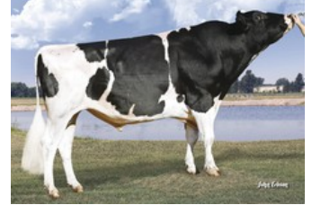
Jenniton Bolton Ray-ET, proven bull

Spread P x VG-87 Money P x VG-86 Stormy Red x GP-83 Salvatore Rc x Yoder x VG-85 Donatello x EX-90 Man-O-Man x EX-90 Bolton x EX-90 Boss Iron x EX-90 Rudolph