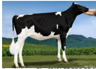
Leaninghouse Sltrc 23491-ET RDC GP-83