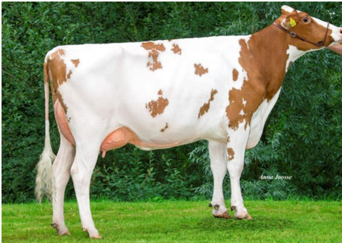
R&B Solitair Aisha P Red VG-86