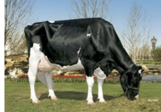
Kamps-Hollow Durham Altitude EX-95