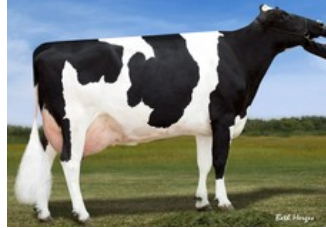
Sandy-Valley Bolt Sheila EX-92