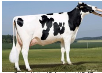
Sandy-Valley IO Amethyst VG-87