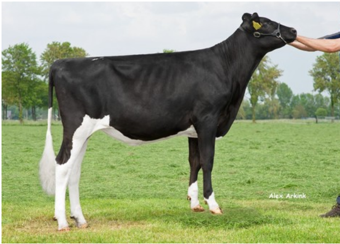
Willem's Hoeve Javina 1242