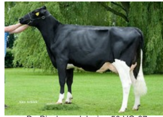
De Biesheuvel Javina 50 VG-87