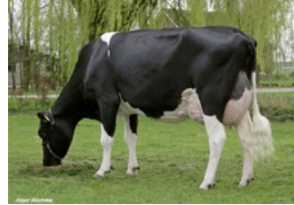
De Biesheuvel Javina 3 VG-87