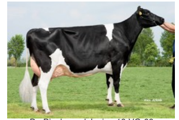
De Biesheuvel Javina 19 VG-88