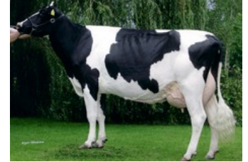
De Biesheuvel Delta Javina VG-88

Balisto x VG-87 Gofast x VG-88 Bolton x VG-87 O Man x VG-88 Dustin x VG-85 Webster x VG-85 Branco x VG-87 Jabot x VG-86 Mascot x GP-81 Blackstar