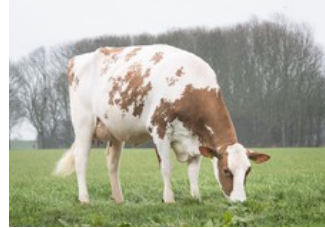
Koepon OH Rubels Range 17 Red VG-86