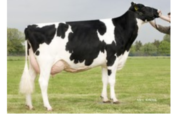
Holbra Mascol Pam VG-87

Boraz RDC x VG-86 Rubels-Red x VG-86 Salvatore Rc x VG-89 Rubicon x GP-83 Aikman RDC x VG-85 Man-O-Man x VG-87 Mascol x VG-88 Durham x EX-90 Rudolph x EX-95 Chief Mark