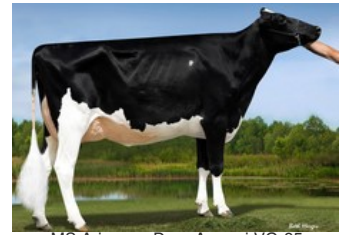
MS Ariannas Door Armani VG-85