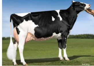
BVK Atwood Arianna EX-94