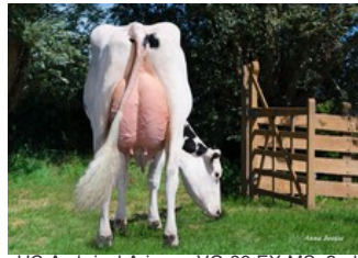
HC Archrival Arianne VG-89 EX-MS, 2nd