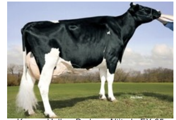
Kamps-Hollow Durham Altitude EX-95