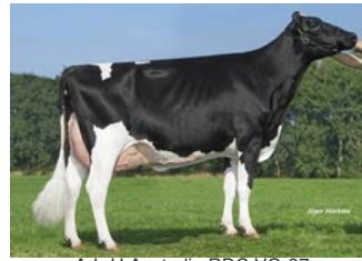
A-L-H Australia RDC VG-87