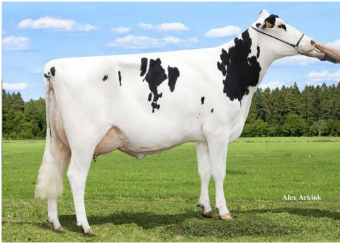
DKR Silence Secret RC VG-85