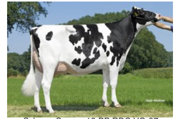
Schreur Serena 13 PP RDC VG-87