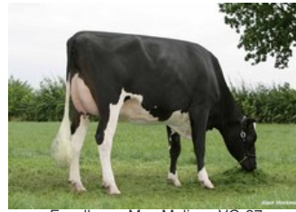
Excellence Mac Melissa VG-87