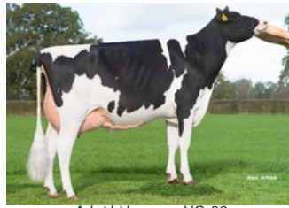
A-L-H Havanna VG-86