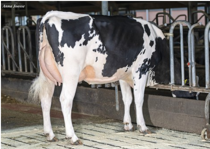
De Wijde Blik K&L Pipa 2 VG-86