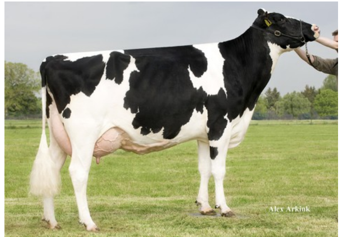
Holbra Mascol Pam VG-87

VG-86 Bellwether x VG-86 Concert x VG-85 Background x VG-86 Suran x VG-86 Gerard x VG-87 Mascol x VG-88 Durham x EX-90 Rudolph x EX-95 Chief Mark x EX-91 Sexation