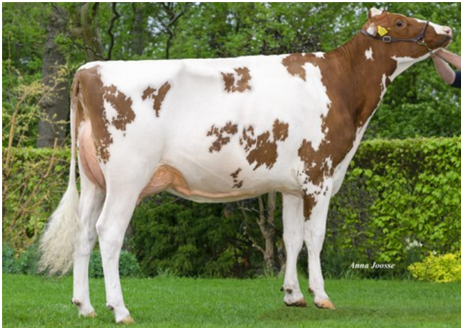
Quatropoint K&L SW Roseanne VG-85