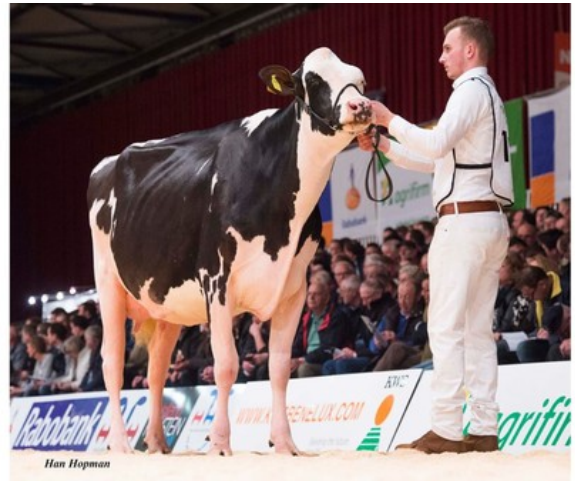
Zandenburg Meridian Camilla VG-89

VG-89 Meridian x VG-89 Snowman x VG-88 Ramos x VG-89 Laudan x VG-87 Jocko x VG-85 Mtoto x VG-88 Slocum x VG-85 Southwind x VG-85 Secret x VG-88 Complete