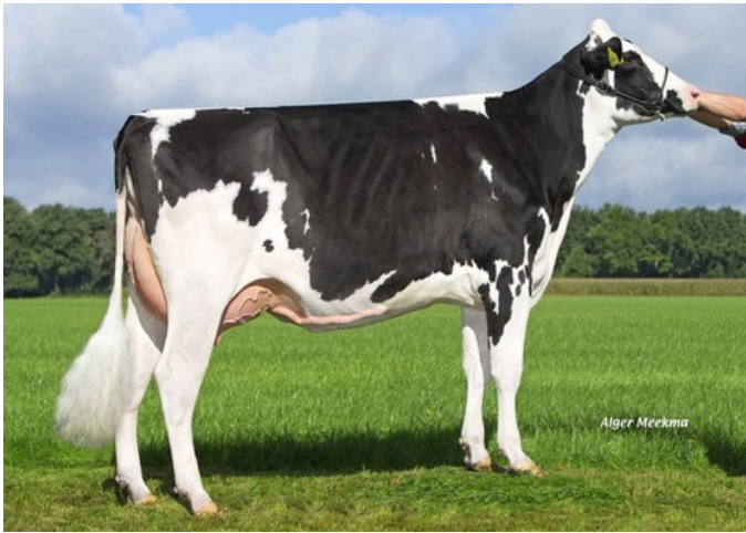
Zandenburg Meridian Camilla VG-89