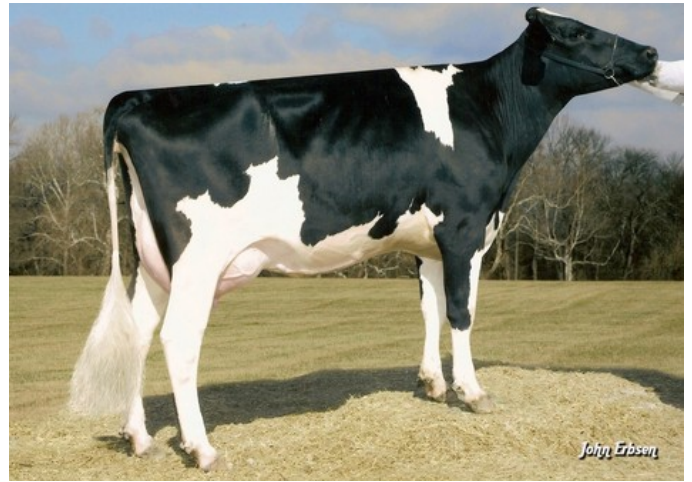
Pine-Tree Martha Sheen VG-86

GP-84 Charl x VG-86 Jedi x Supershot x Doorman x VG-87 Robust x VG-87 Zenith x VG-86 Shottle x VG-86 O Man x EX-92 Rudolph x EX-90 Bell Elton