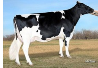
Roylane Shot Mindy 2079 VG-86