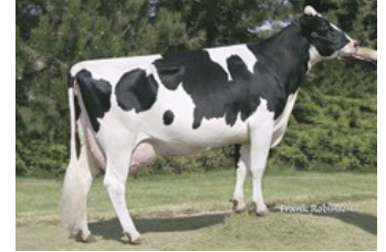
Seagull-Bay Oman Mirror VG-86

GP-83 Frazzled x VG-87 Bookem x VG-86 Shottle x VG-86 O Man x EX-90 Manat x EX-91 Celsius x VG-85 Melwood x VG-85 Secret x EX-91 Tony x VG-87 Haven