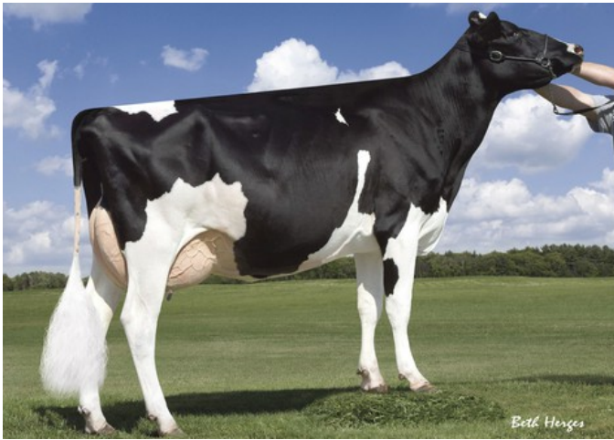
Roylane Socra Mira 1760 VG-86