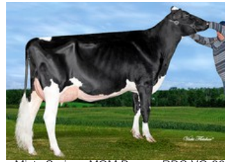
Misty Springs MOM Brenna RDC VG-86