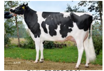
Brigitta PP RDC GP-84