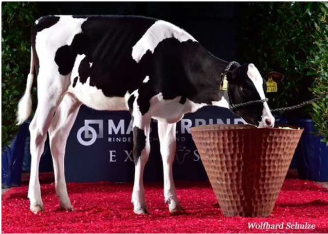
Basic PP RDC