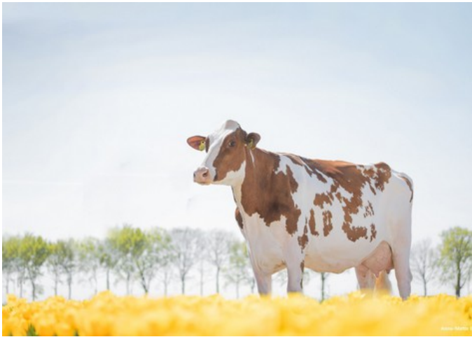
Drouner AJDH Aiko 1288 (Olympian) EX-91