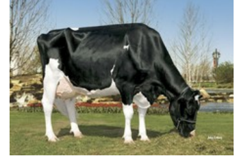
Kamps-Hollow Durham Altitude EX-95

VG-88 Born P RDC x VG-85 Brasil RF x EX-91 Olympian RC x VG-87 Freddie x EX-91 Goldwyn x EX-95 Durham x EX-93 Prelude x EX-94 Jubilant RF x EX-96 Marquis King x EX-90 Brutus