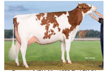
Drouner AJDH Aiko 1288 Red EX-91