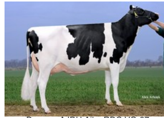
Drouner AJDH Aiko RDC VG-87