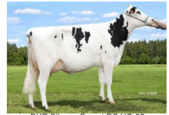
DKR Silence Secret RC VG-85