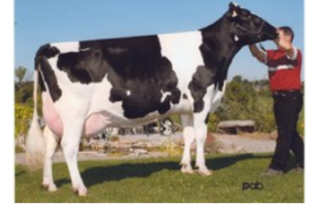
Gen-I-Beq Durham Sherry VG-87

VG-87 Apo Red PP x VG-85 Silver x GP-83 Earnhardt P x GP-82 Colt P x VG-85 Socrates x VG-87 Goldwyn x VG-87 Durham x VG-86 Formation x VG-88 Aerostar x EX Enhancer