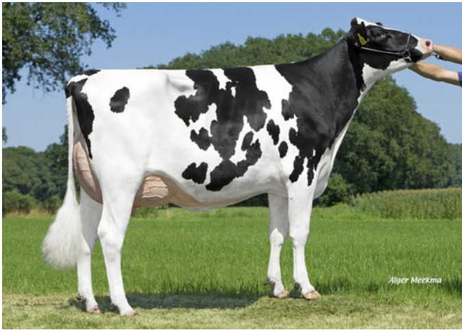
Schreur Serena 13 PP RDC VG-87