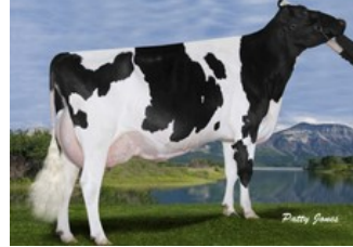
Gen-I-Beq Goldwyn Secret RC VG-87