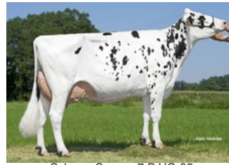
Schreur Serena 7 P VG-85