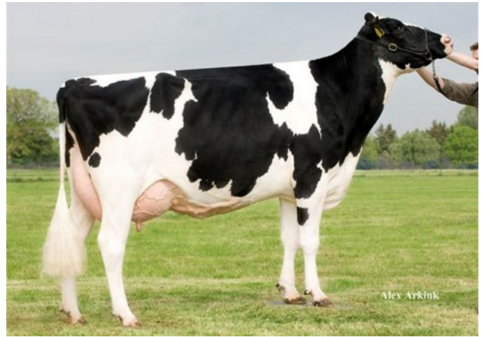
Holbra Pam VG-87

VG-86 Lucky PP-Red x GP-84 Fireman Red x GP-83 Aikman RDC x VG-85 Man-O-Man x VG-87 Mascol x VG-88 Durham x EX-90 Rudolph x EX-95 Chief Mark x EX-91 Sexation x EX-93 Elevation