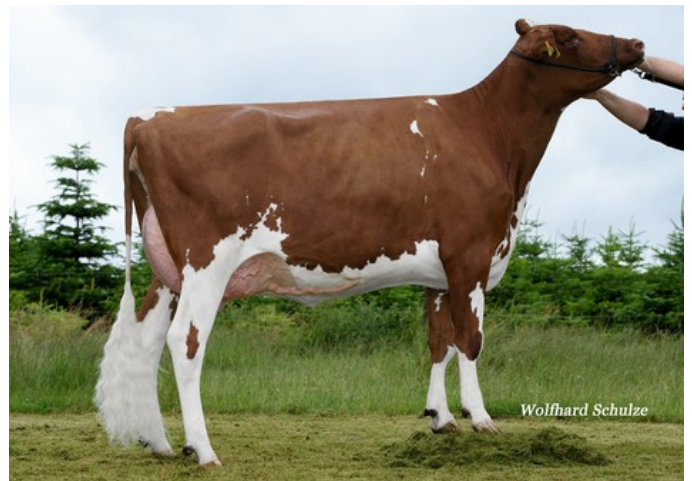
BHA Amore Red VG-89

Mcdonald-P-Red x VG-85 Solito Red x VG-89 Diamondback RDC x EX-91 Godewind x VG-87 BURAN x VG-87 Glacier-Red x VG-85 Reno