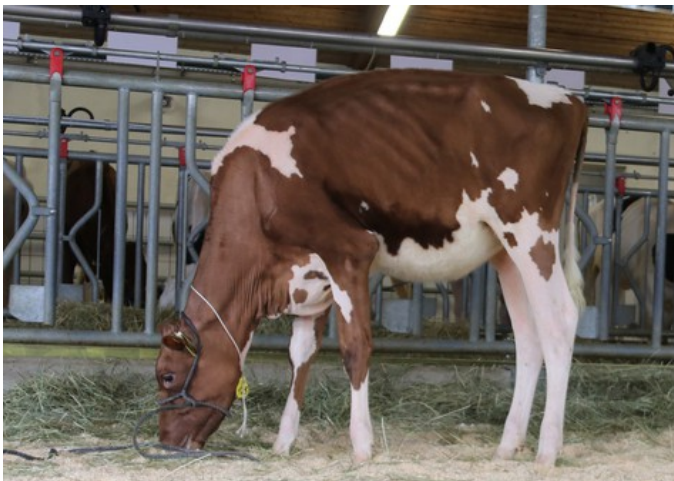
BHA All You Want-Red

BHA ALL YOU WANT RED DE 818115360 DOB 03-03-2022