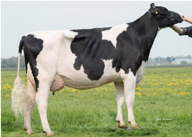
CEH Mandoline VG-86