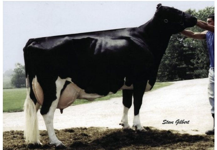
Wesswood-HC Rudy Missy EX-92

Missouri x VG-86 Balisto x VG-88 Snowman x VG-88 Superstition x EX-90 Shottle x VG-85 O Man x EX-92 Rudolph x EX-90 Bell Elton x VG-87 Mandingo x VG-87 Astro Matt