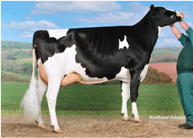
KNS Rendezvous VG-85