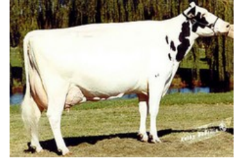
D-R-A August EX-96

Rammstein Red x VG-86 Solitair P Red x Alaska Red x VG-85 Salsa RC x VG-87 Supersire x VG-85 Alexander x EX-91 Goldwyn x EX-95 Durham x EX-93 Prelude x EX-94 Jubilant RF