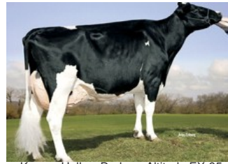
Kamps-Hollow Durham Altitude EX-95