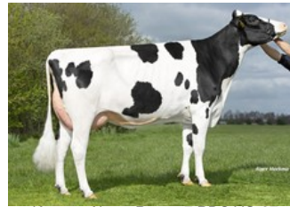
Koepon Altuve Range 7 RDC VG-87