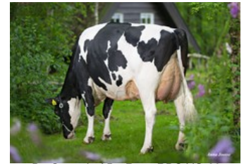
De Oosterhof Dg Rose RDC VG-89