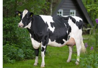
De Oosterhof Dg Rose RDC VG-89