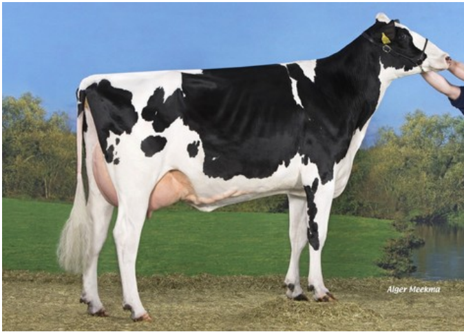
Koepon Mano Classy 90 VG-85