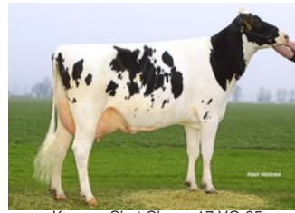
Koepon Shot Classy 17 VG-85