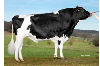
Same family: Koepon Beatclub

Ranger-Red x VG-86 Crimson x VG-85 Imax x Silver x GP-83 AltaOak x VG-85 Man-O-Man x VG-85 Shottle x VG-86 Simon x VG-86 Merrill x VG-88 Bell Elton