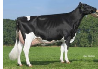
A-L-H Australia RDC VG-87