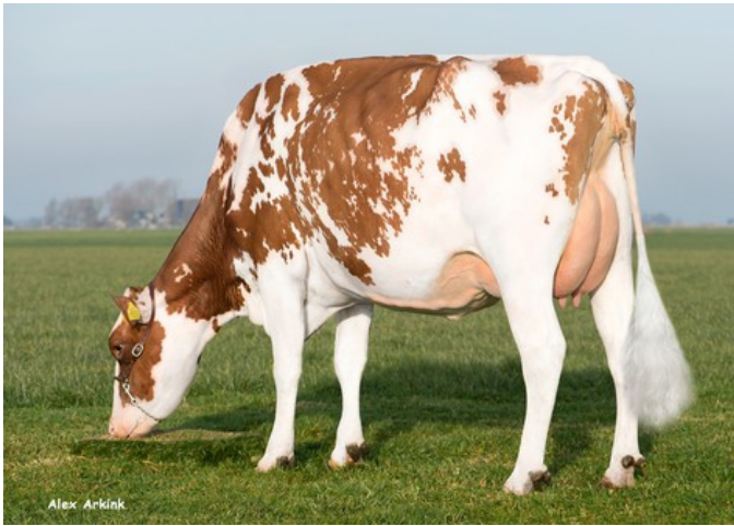
Batouwe Salsa Aiko Red VG-85