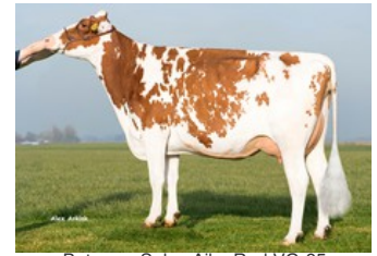
Batouwe Salsa Aiko Red VG-85