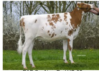
R&B Sw Aimy Red VG-85